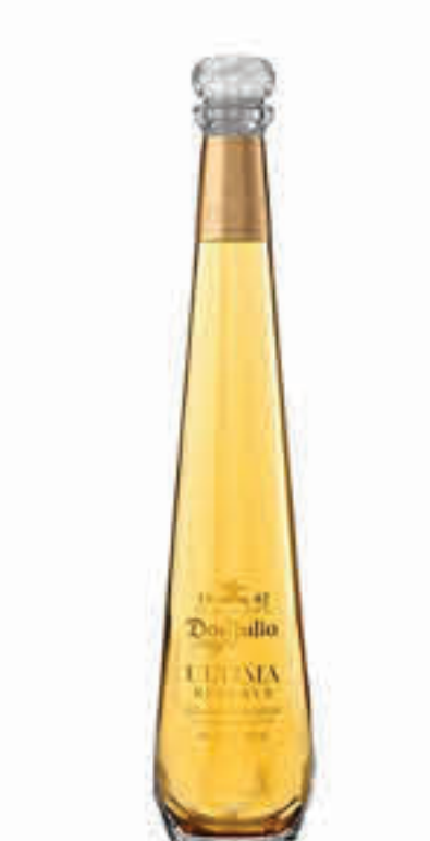
DON JULIO RESERVE 100