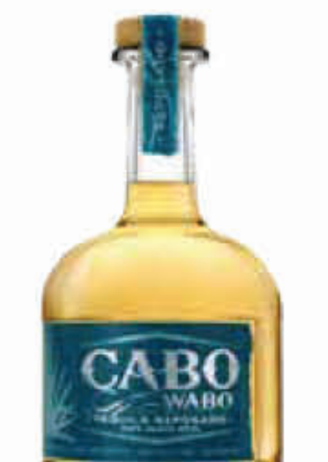
CABO WABO 13