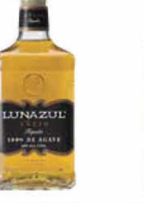
LUNA AZUL MILAGRA 12