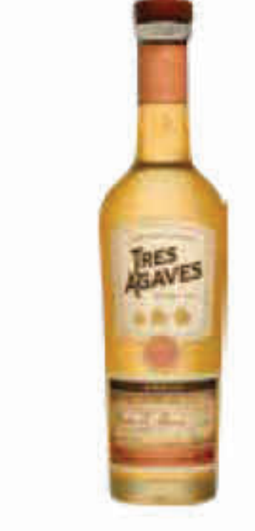
TRES AGAVES 14