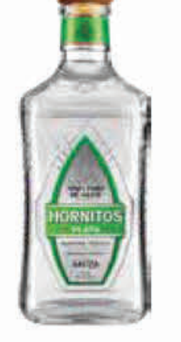
HORNITOS EL JIMADOR 12 13