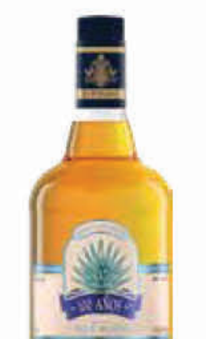
100 ANOS 10