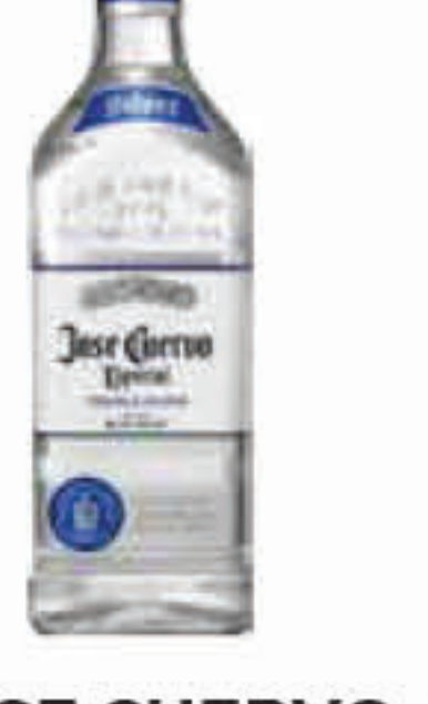
JOSE CUERVO MILAGRO