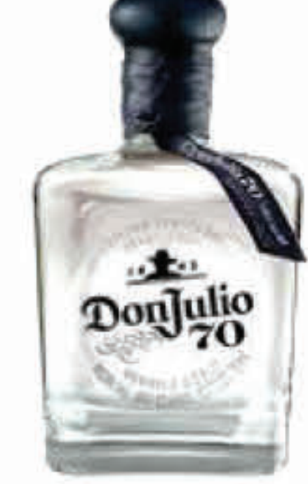
DON JULIO 1942 70TH ANNIVERSARY