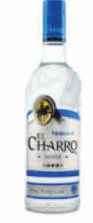
EL CHARRO 12