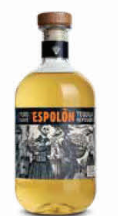
ESPOLÓN LUNA AZUL 13 13