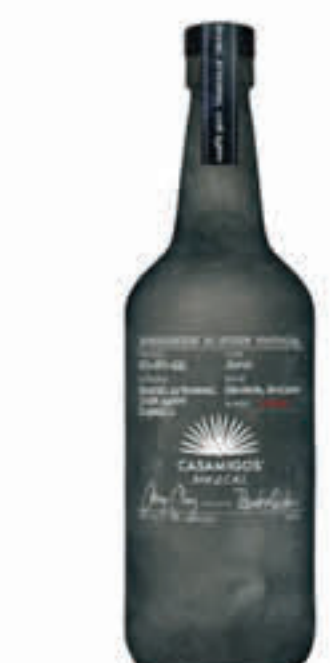
CASAMIGOS MEZCAL 15