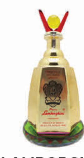
LAMBORGHINI PATRIZ 50