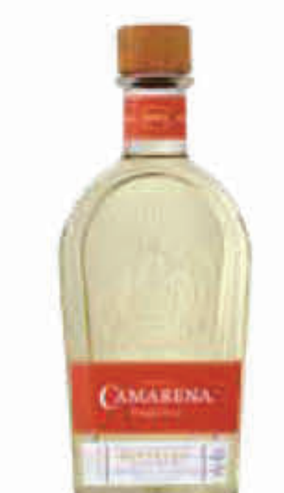
CAMARENA CASAMIGOS CAZADORES 11