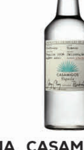
CASAMIGOS BLANCOS 14