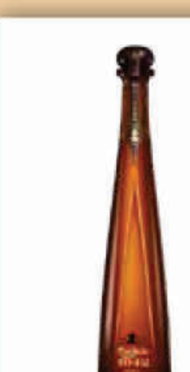
DON JULIO 1942