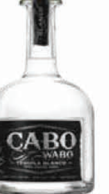
CAZADORES CABO WABO