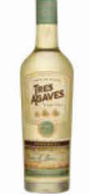
TRES AGAVES 13