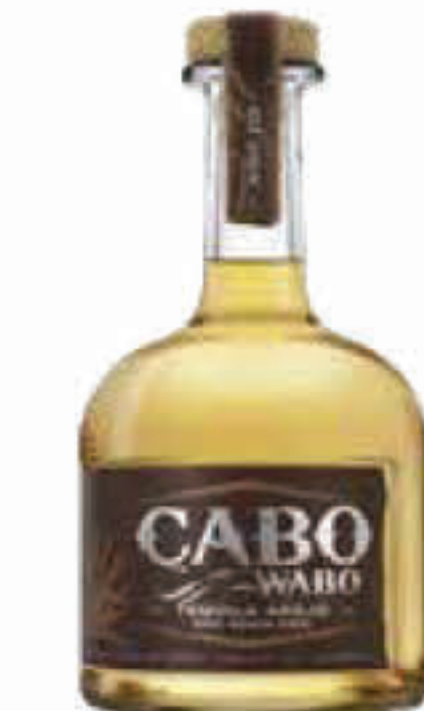
CABO WABO 14