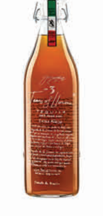
TEARS OF LA LLORONA