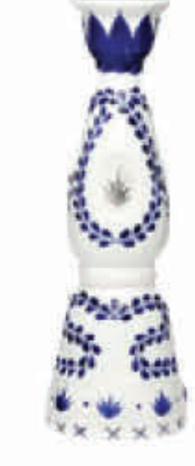
CASA AZUL 40