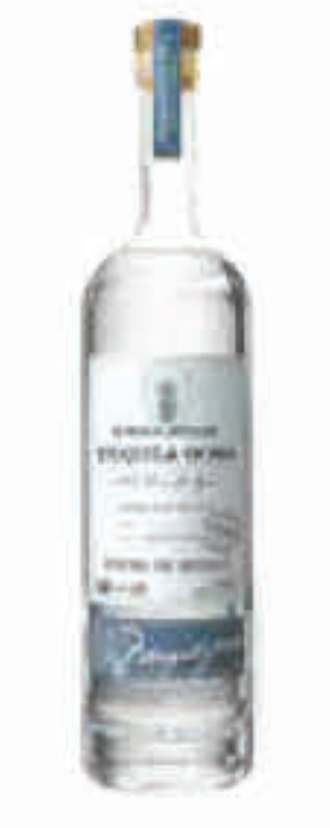
TEQUILA OCHO 25