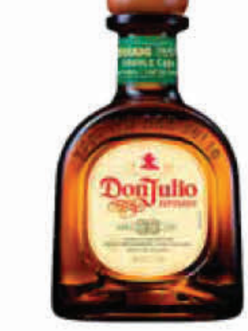
DON JULIO 13