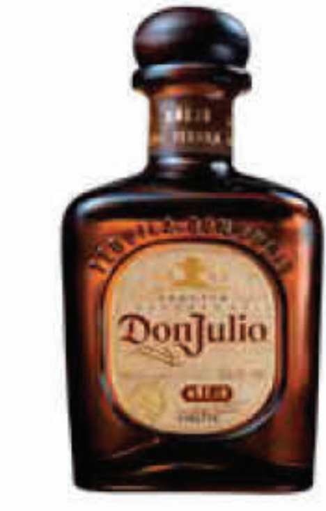
DON JULIO 14