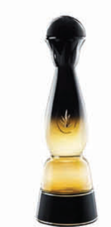
CASA AZUL GOLD